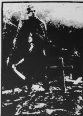
Alexander's new grave in Venray